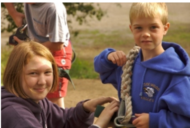
Helping a Ness Lake camper to climb

Available December 1, 2008. NLBC hosts 100 Guest Groups annually. The GSM will book and invoice all Guest Groups and recruit, train and deploy staff as required to meet or exceed the expectations of our guests. Time will be split between the PG office and camp. Special consideration will be given to applicants with experience in hospitality and marketing.