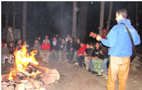
Campfire time at Lake of the Trees Bible Camp.