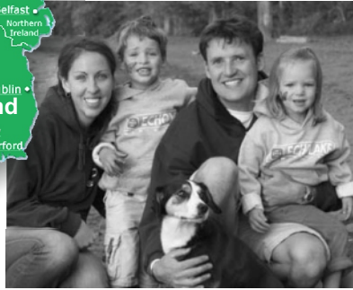
The Ducans with their two children

The following summer, while staying up at Fort St James, Steve was asked to speak at a teens camp at Echo Lake Bible Camp.