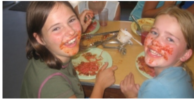
Clearwater campers at a “Utensil Meal”

God’s faithfulness continued at Clearwater Bible Camp .