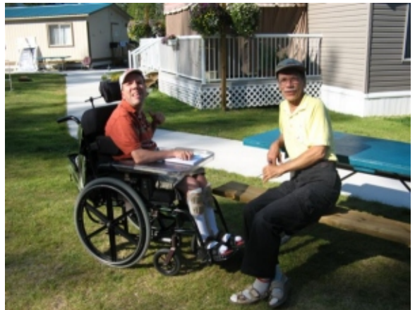
Amasa campers enjoy Camp Elk Canoe facilities