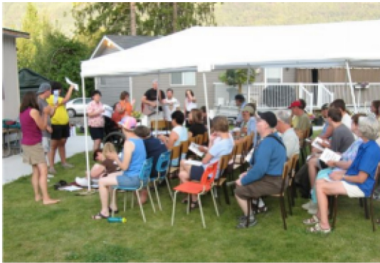
Campers enjoy outdoor chapel at Amasa Camp

Over the years it grew, being led by a team of four full time staff, with over 10 weeks of camp a summer, and year round follow up clubs.