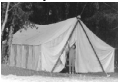
Camps began with tents for cabins

God provided in all sorts of creative ways for new Bible Camps to be established. In 1960 Lake of the Trees Bible Camp began with a trek through the forest to a remote lake on crown land leased from the government. Tents