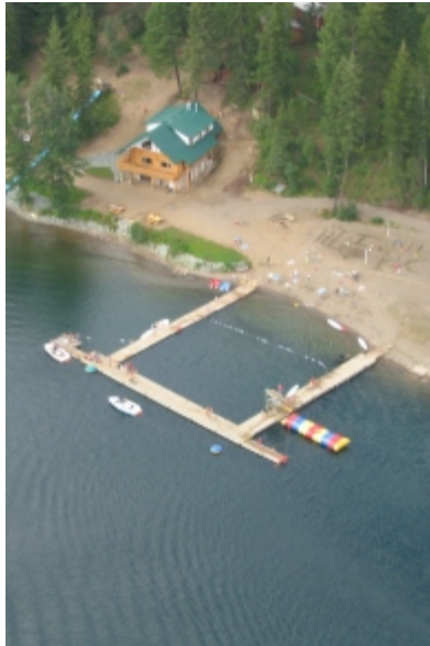
Water front docks at Ness Lake

Pray that the right candidate will fill this critical position soon and that they will lead and build a strong team!