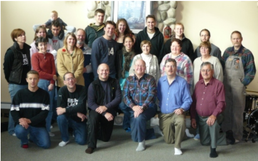
CSSM BC missionary team gathered at our fall staff retreat at Ness Lake

For more details on these missionary positions, please see our website at www.cssm.ca/bc and click Career Positions .