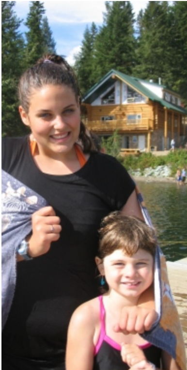
Staff and camper at Ness Lake beach