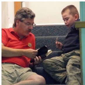
Counseling a camper

Pray as well that as the camps seek to connect them with the local church that their parents will be willing to bring their children to church.