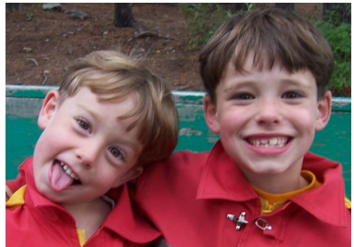
Campers at Echo Lake Bible Camp